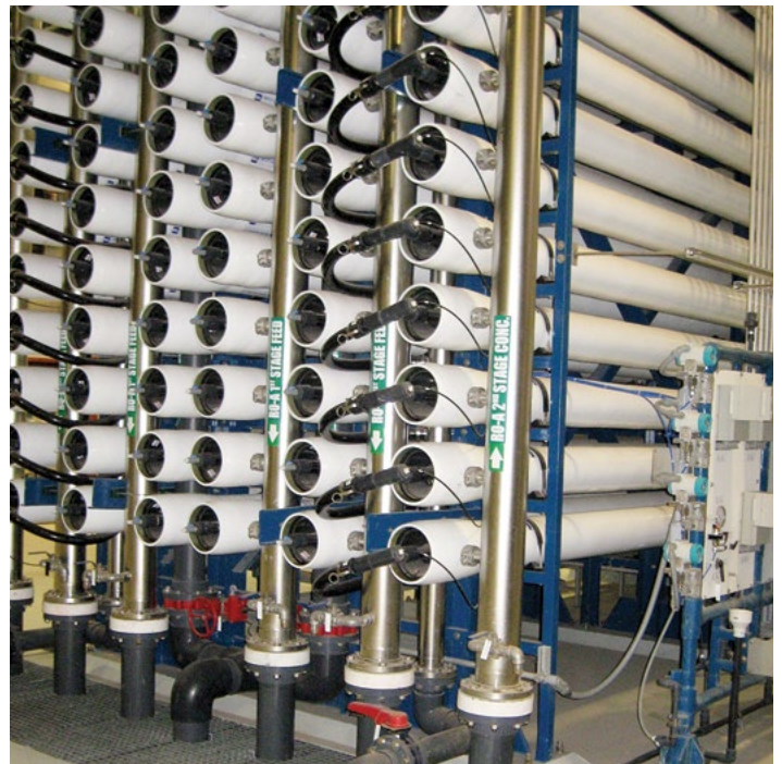
Texas has an estimated 2.7 billion acre-feet of brackish groundwater.

External/internal factors: With this exceptional item and funding, the agency could continue efforts to meet statutory deadlines by accelerating the progress of