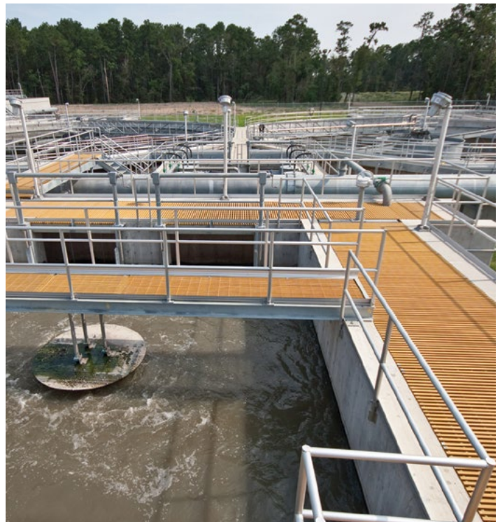
Federal changes to the CWSRF have expanded the types of projects eligible for assistance.

The legislature should change the relevant sections of the Texas Water Code to reflect the changes made by the federal Water Resources Reform and Development Act of 2014 (WRRDA). WRRDA amended the Federal Water Pollution Control Act, and these changes have a direct impact on the CWSRF. WRRDA expanded the types of projects and activities eligible under the Texas CWSRF program. In addition, it allowed direct loan terms of up to 30 years, provided the term does not exceed the useful life of the project.