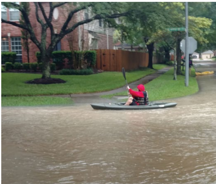
The TWDB is placing a high priority on current and future flood-related initiatives.