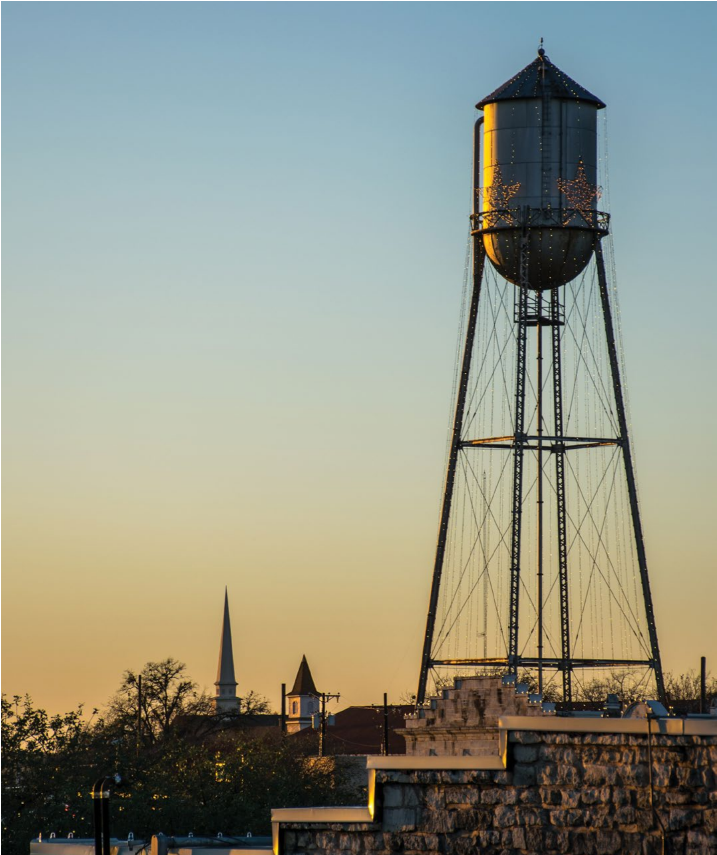
Round Rock, Texas.