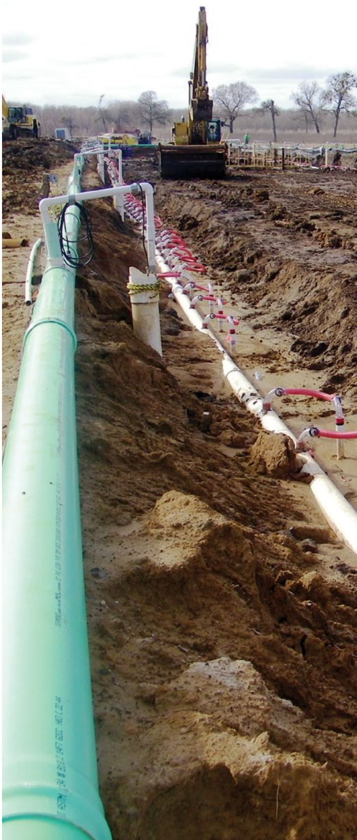
The TWDB administers financial assistance for water, wastewater, flood mitigation, and agricultural water conservation projects.

understanding of existing programs, risks, and needs for mitigation measures across the state. Incorporating broad input from a variety of stakeholders, the assessment provides information and policy recommendations for use in furthering comprehensive flood management in Texas. The final State Flood Assessment report will be delivered to the 86th Texas Legislature in December 2018.